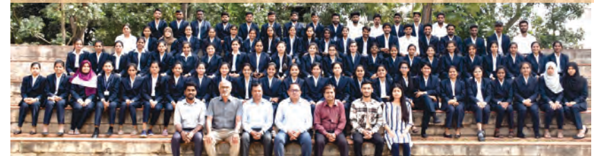
Comprehensive | Specialized | Innovative