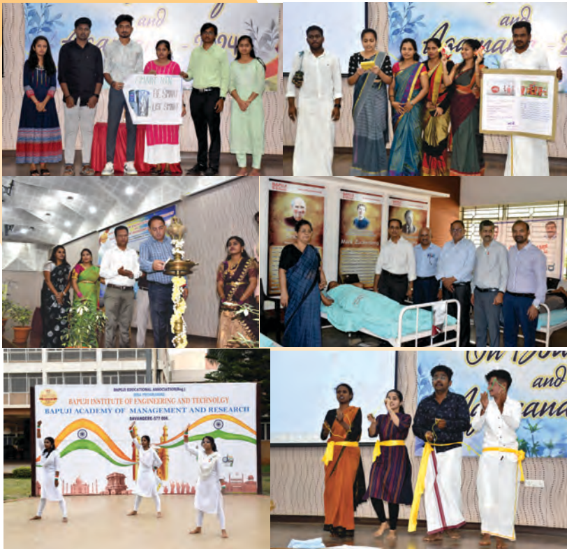
Celebrations | Foundation Day | Octagon | Cultural Entertainment

The Student Activity Cell is a vibrant and dynamic hub dedicated to fostering a holistic development environment for students. This cell organizes a wide range of extracurricular activities that complement the academic curriculum, promoting a balanced and engaging educational experience. It offers opportunities for skill development, including soft skills, leadership, and team-building, while ensuring an inclusive environment where all students can participate and explore new interests. It is committed to creating a lively and enriching campus life, empowering students to explore their potential, build meaningful connections, and create lasting memories during their academic journey.